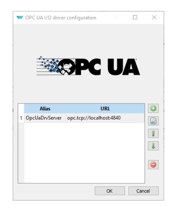
Figure 2.2: OPC UA Client driver – table of clients

Namespace definitions – section for definition of the namespaces as they are defined on the server